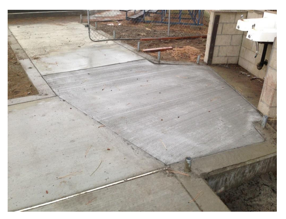
APRIL 8, 2013