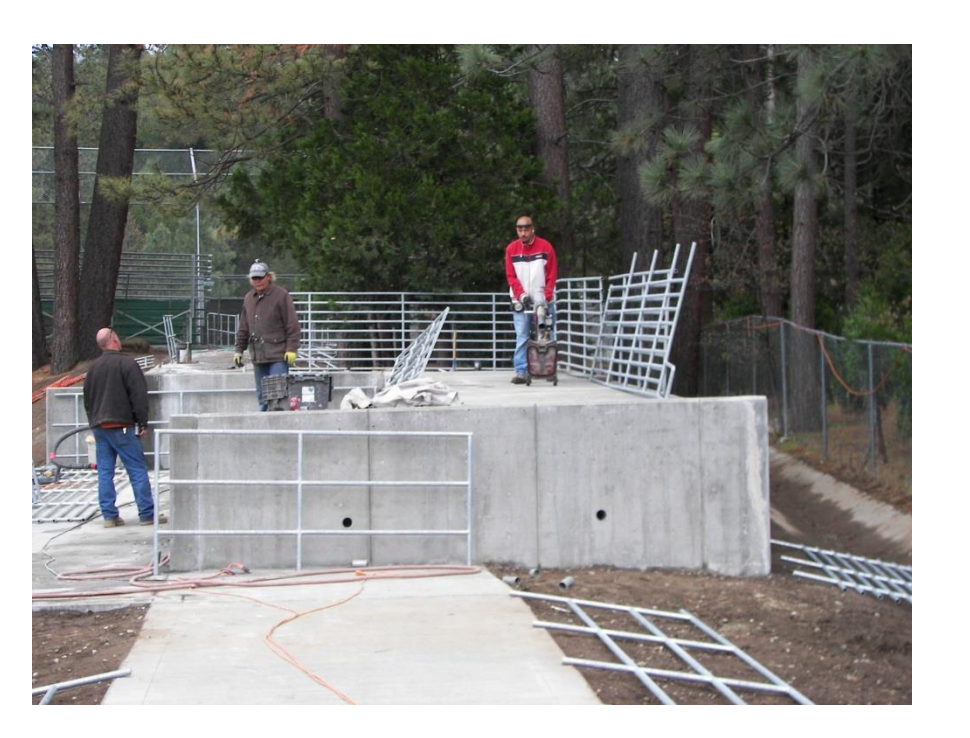
MAY 9, 2013